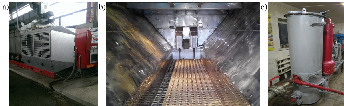
Fig. 1. Grain dryer (a), dryer working zone (b) and gasifier (c) views

The investigation was made by multifactor experiments. Design of a proposed dryer, Fig. 1a, Fig. 1b, equipped with the gasifier, Fig. 1c, features pseudofluidizing grain material not by the whole drying surface, but gradually by sections. In every moment of time grain is blow through with hot air on one part of the drying zone. Here it appears in pseudofluidized state. An intense drying is held and a wave is created that helps transporting grain along the drying chamber. At the same time the rest of grain stays in calm state. Heat redistributes equally within the layer as well as moisture redistributes inside each grain moving from inner to outer layers by capillaries.